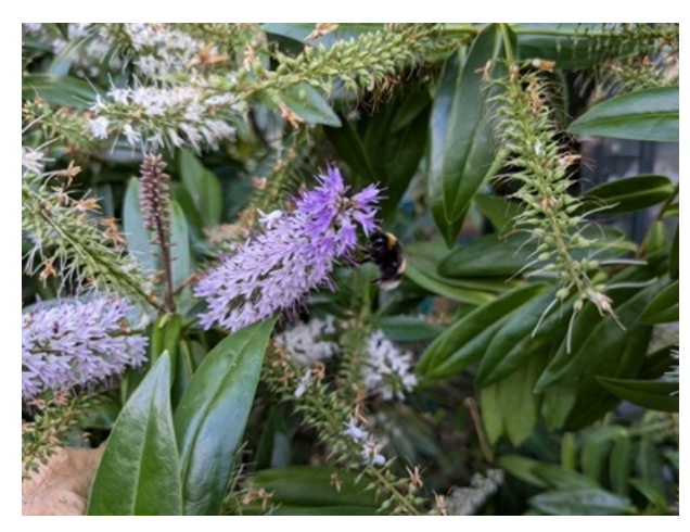
Bumble bee on hebe.

The Asian Hornet Committee meet on the 18th this month and I hope to have more information for you going forward.