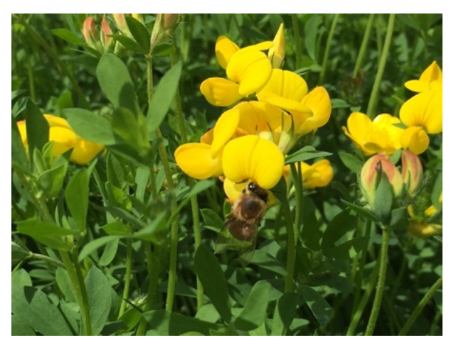
Bird's Foot Trefoil

Be aware of the Silver Lime ( Tila tormentosa ) which is an exotic introduction and flowers a bit later than our native limes. Its nectar is toxic to bees and when there