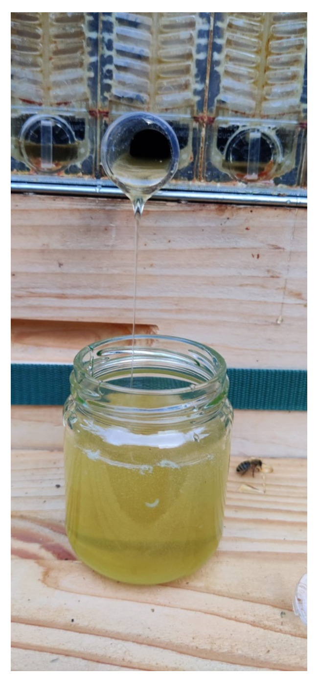
Harvesting from a flowhive.

Check space. Once the nectar flow starts then most colonies abandon the idea of swarming as it is now not in their interests to do so. There is still a small risk of