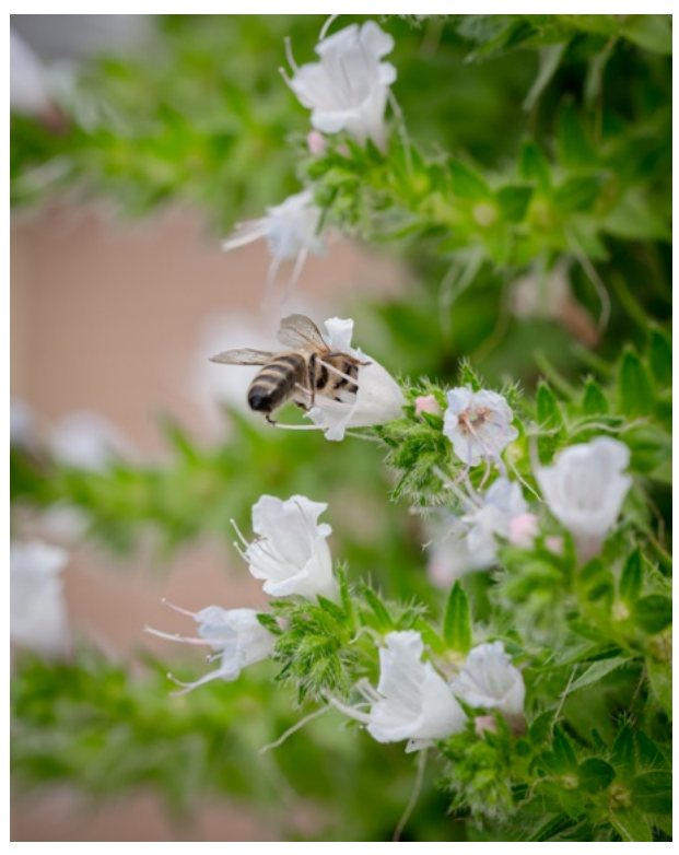
From Abbey Gardens.