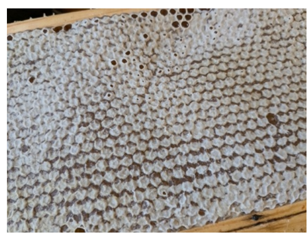
(Mostly) capped super.