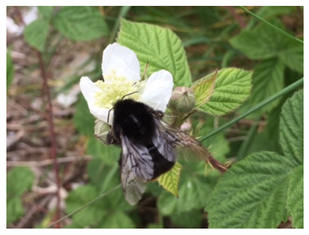
Red tailed bumblebee on bramble blossom.