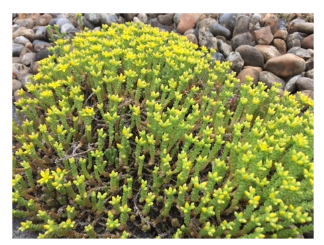
Sedums blooming on a roof top in Chancery Lane.

may be looking for only 1 or 2 infected cells in the whole colony.