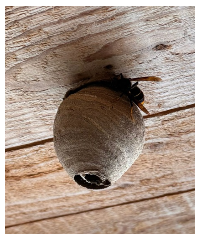
Elena posted this picture on Whatsapp of the early stages of Asian Hornet nest in Italy, explained she's in one of the worst-affected areas and that beekeepers here have adopted a nomadic beekeeping approach, moving hives at higher altitude as a form of protection from Asian Hornet. She reported the nest and that someone was coming to remove it.

we are pitching events wrongly. The committee is trying its best to understand what members want. A survey we did two years ago suggested strong support for educational activities and in-person meetings, but there has been low take-up on these when we have tried to run them. We have been trying to hold meetings where there are bees, with next July's meeting being a good example, but many of our pre-COVID meetings were well-attended even with no apiary present. We would welcome insights from members: please email services@lbka.org.uk.