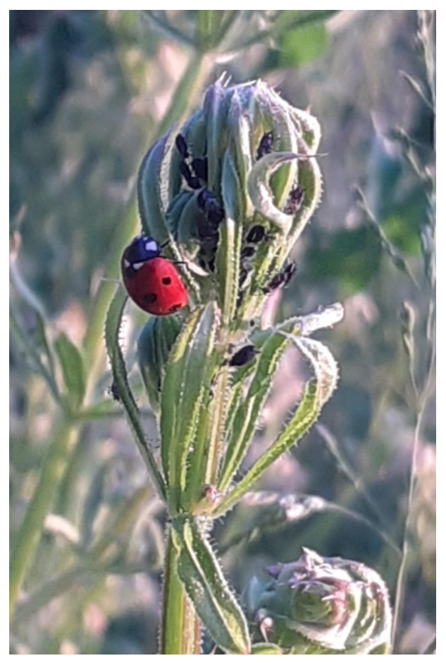
"An aphid treat". Caption and photo: Guillaume Tremorin