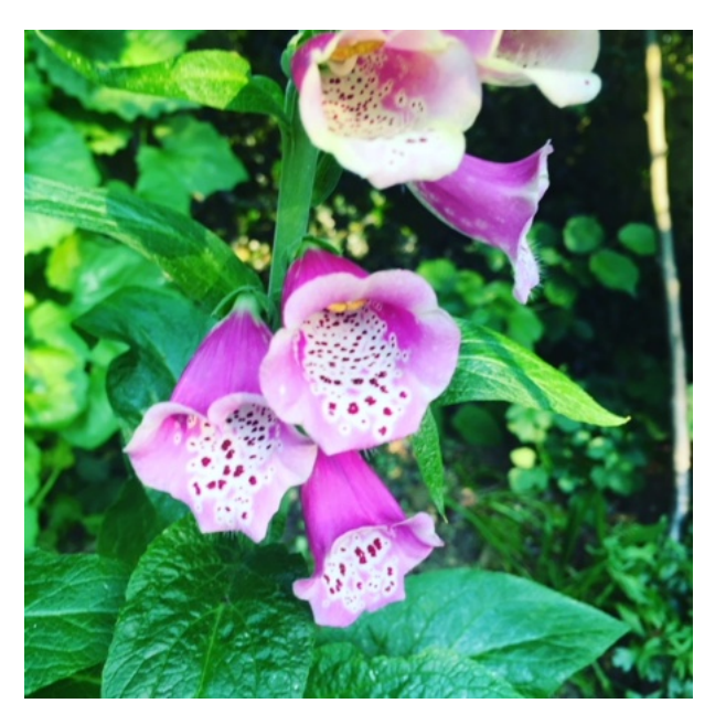
Foxgloves are out now.

Early summer – June in particular – is a time of the year