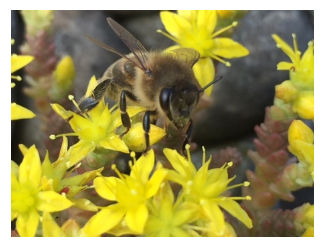
Honey bee on sedum ocre