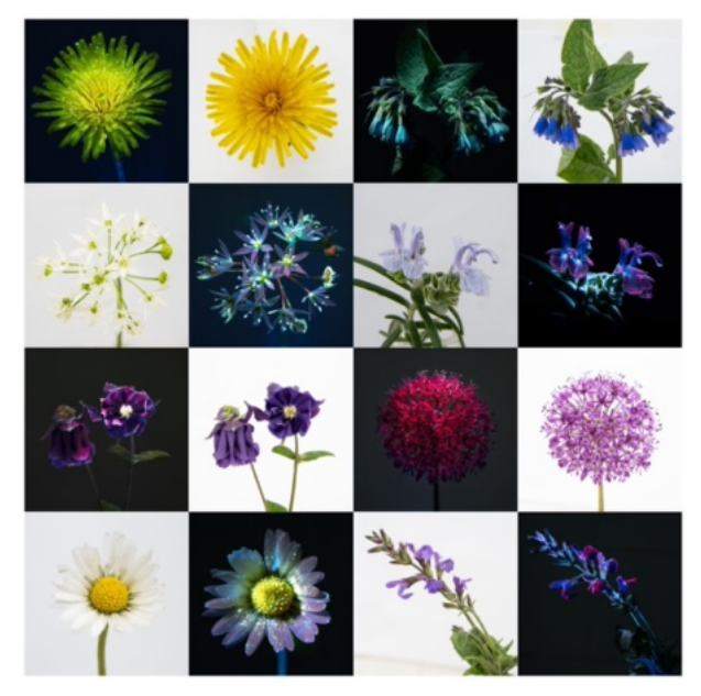
How bees see