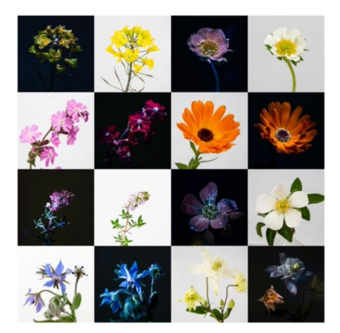
How bees see

removing the stone and tying the sheet around the box. It can then be hived.