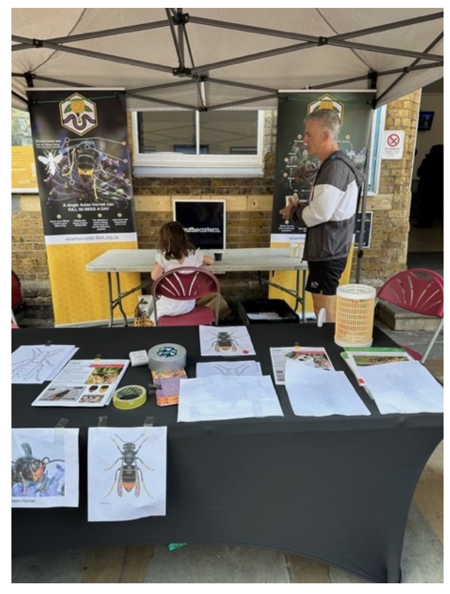
Asian Roadshow at Herne Hill Market.

See updates from apiary managers on page 11.