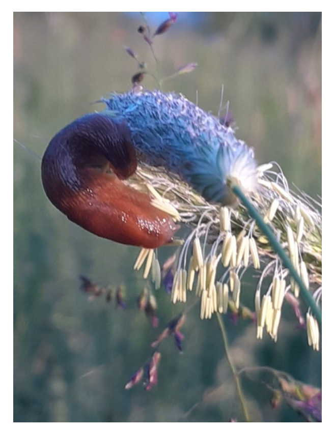
"Pollen breakfast for a wingless pollinator".