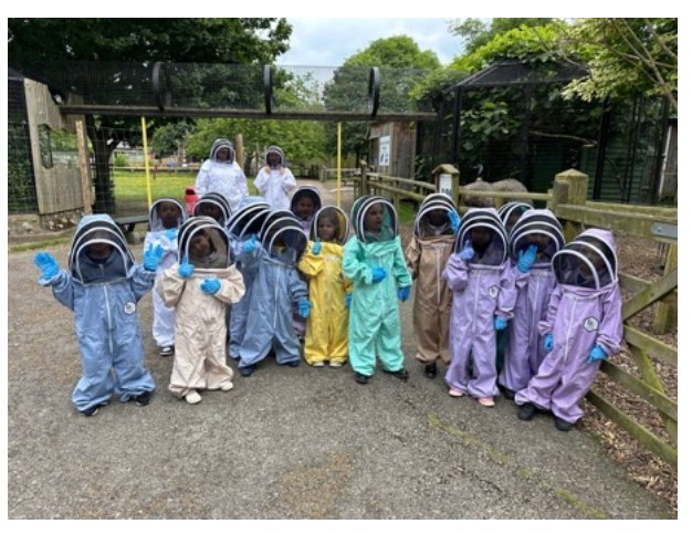
Moreland Primary school on the way to the apiary in front of the kookaburras.

One of the School Food Matters sessions happened today. We entertained two schools with attendant teachers, assistants and parents and two people from whole foods shop Piccadilly. The morning was 30 secondary special needs young people who I think gained a lot