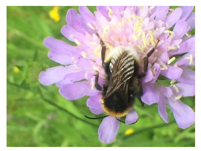
A bumblebee on field scabious.

which brings uncertainty for many a beekeeper, and for those in rural areas in particular. June is the beginning of the summer season when the spring flowering plants and trees shed their blooms having been pollinated and now begin to form seeds, but the main flow of summer flowering blooms has yet to begin. Beekeepers refer to this period of change as the June Gap.