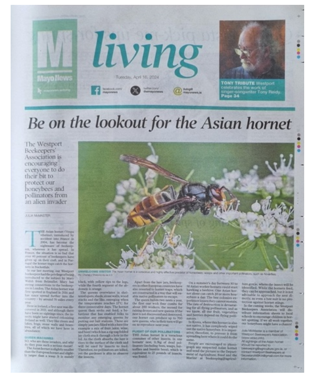
Article in Mayo News.

nance. We do not recommend beginners to start with swarms.