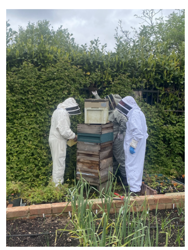
Swarm collection.

The unexpected often presents itself in the realm of bee-keeping, and the first week's session was no exception. As attendees enjoyed a lunch break, they were astonished when a swarm of bees descended on the boysen-berry plant adjacent to the apiary. This spontaneous event provided a serendipitous opportunity for participants to witness firsthand the natural phenomenon of swarming and the subsequent collection. Although not part of the planned schedule, the impromptu experience