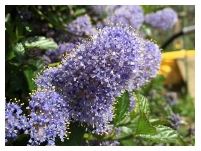
Ceonothus up close.