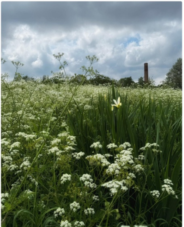
Mudchute is amazing just now. It looks beautiful with the cow parsley in full bloom, with so many honey and other bees foraging there just now - butterflies too.