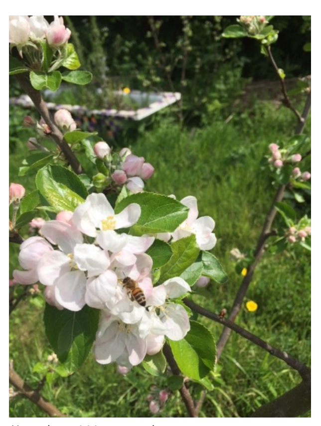
Honey bees visiting my apples.