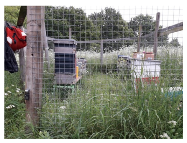
"Mudchute all set for assessments. Fingers crossed the weather holds!" . Photo and caption: Tristram Sutton.

special thank you to the hotel who delivered a lovely meal for nearly 60 beekeepers.