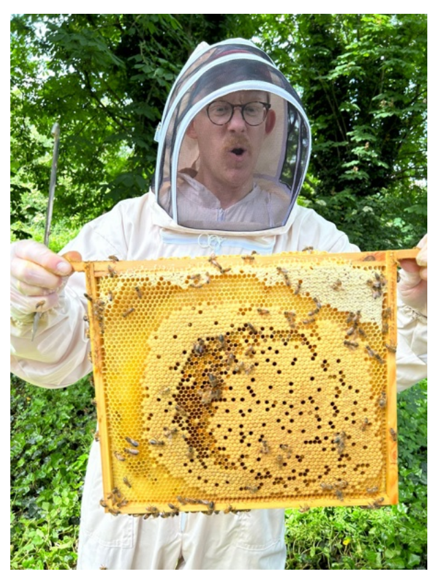
"Some of our members are preparing to take the BBKA Basic Assessments". Good luck!

For more information and to offer your support please contact treasurer@lbka.org.uk.