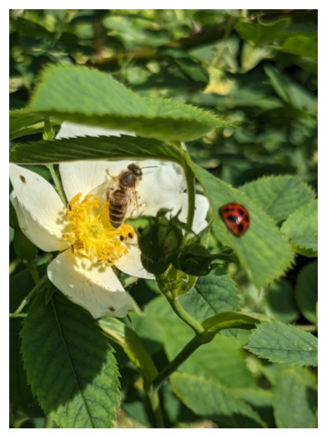
Bee and ladybird on a wild rose.

June's Monthly Meeting falls on the same weekend as our stall at the Lambeth Country Show, a valuable opportunity to showcase our work, spread the knowl-