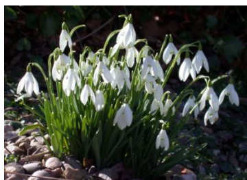
Single snow drops

Few native wild plants are flowering for bees to take advantage of, but fortunately there are a few garden plants that do and they offer a lifeline to bees venturing out to forage on mild winter days. Here's a few of my favourites: